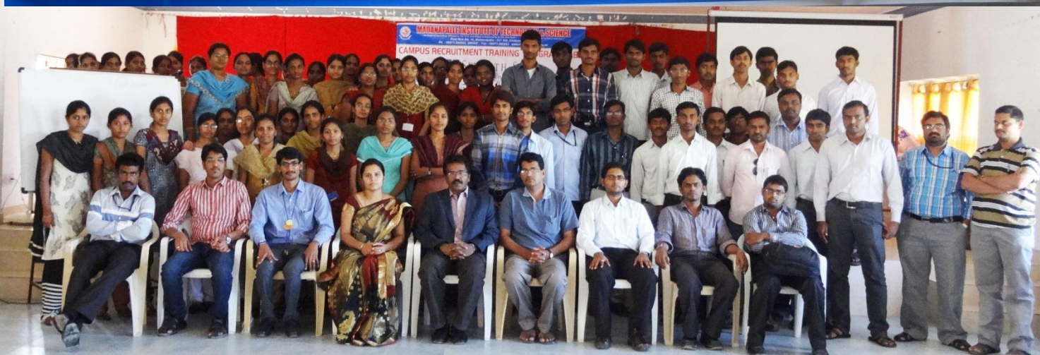
Principal, TEQIP Coordinator, Training officer, Students with Resource Persons